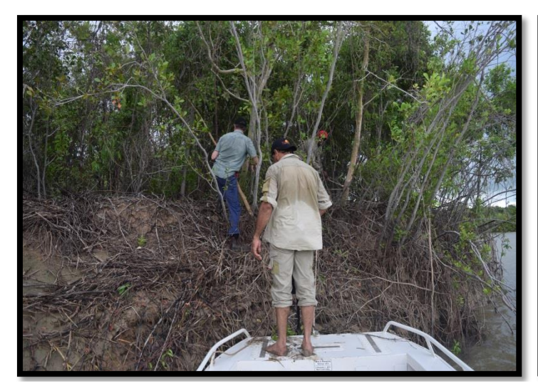
Training module 2: Safe method and procedure on how to approach a crocodile nest.

Above: Rangers conducting the boat survey