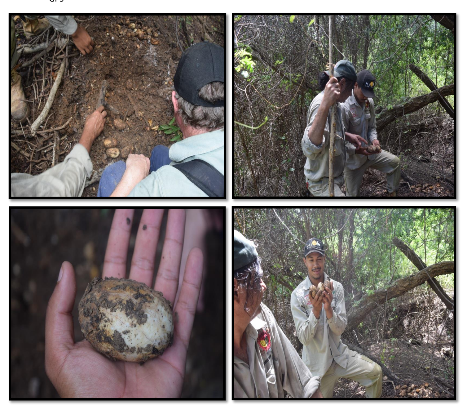
All above: Opening a crocodile nest and counting eggs

With the completion of this training Rangers are now able to comprehensively monitor croc numbers in local waterways and deal with any rogue individuals, creating a local solution to a local problem. The training also has the potential for Gangalidda and Garawa people to begin investigating commercial aspects of croc management, a long term aspiration of Traditional Owners.